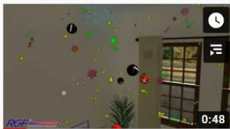
RGF's REME HALO® Air Purification System for Your Home RGF® Environmental Group, Inc. • 132K views • 4 years ago