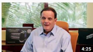
RGF® Environmental Group Study: REME HALO Inactivates SARS-CoV-2 by 99.9% RGF® Environmental Group, Inc. • 6K views • 4 weeks ago